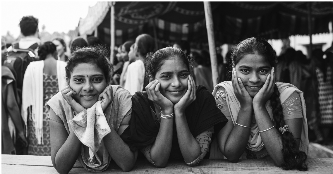
Three local girls from Tenali, India.

To read more about my experience in India, please visit rockharborindia.wordpress.com . Or to learn more about Harvest India’s work in expanding God’s Kingdom in India, visit harvestindia.org .