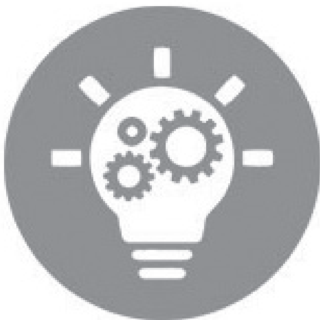
Cornelius Business Plan logo

"Regardless of major or concentration, participants of the Cornelius Business Plan Competition get experience in turning an idea into something tangible which will be very