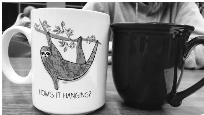
Students bring their favorite mugs and sign up for a small group.

Students who missed this first event can still sign up for a small group. Bible studies are weekly, but anyone is welcome to jump in at any time.