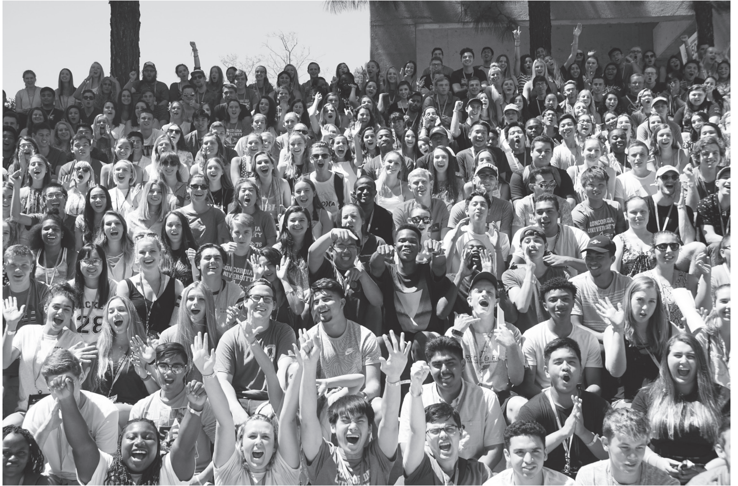
Concordia students excitedly welcoming the year at CUI SOAR.

will be preparing you for a night full of fancy fun at Homecoming. Attend a special Friday chapel followed by a Cheers and Hoops contest outside of the Caf with the chance to win cool prizes. This