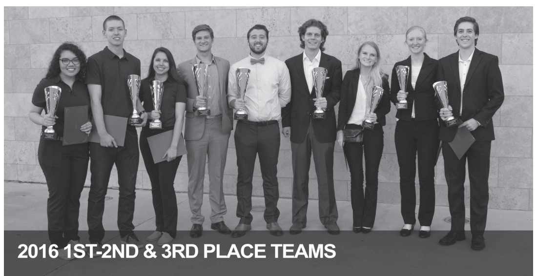
2016 1ST-2ND & 3RD PLACE TEAMS

Winners of the 2016 Concordia School of Business Cornelius Business Plan Competition pose outside of Grimm Hall. The 2018 competition is open to all students, both undergraduate and graduate.